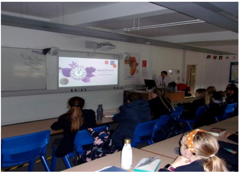
Students learning about Remembrance in their Tutor time!

https://www.britishlegion.org.uk/get -involved/ways-to-give/donate