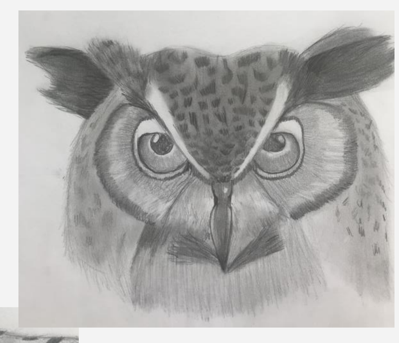
"I have found that drawing helps relax me." Katie L Y8