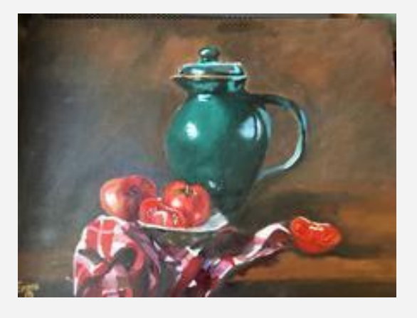
Ema N Y11

Use this link to access the digital show <u>https://shop.rwa.org.uk/collections/alternative-end-of-year-show?</u> fbclid=IwAR1dSgmUHhREzG09FjP_8Ip25rDkLqSkbdgqUAIow8Kfp7aRX2CcS5IXgT0