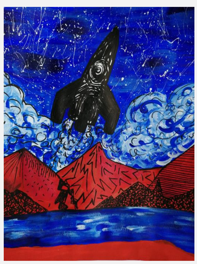
Zena W Y11